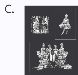
Scrapbook Collage - $30

After selecting A, B, or C from above, you may order additional prints or digital images below. Orders must be paid in full at time of session. Cash, Check, or Venmo @Jenn-Apps . Checks made out to "Jennifer Apps Photography."