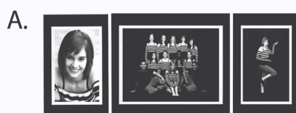
Deluxe Memory Mate - $29

You must purchase A, B, or C below in order to purchase additional prints :