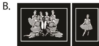
Memory Mate - $25