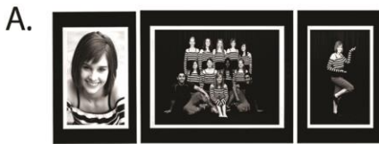
Deluxe Memory Mate - $27

You must purchase A, B, or C below in order to purchase additional prints :